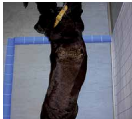
On the right: "after" - 5 November 2009, Balu', 8 years, weight 40 kg, seen from above.

maintenance needs, in the short term, help improving pets' quality of life by achieving acceptable weight loss and the also the improvement of some biochemical parameters such as the circulating levels of glucose, total cholesterol and triglycerides, very important to