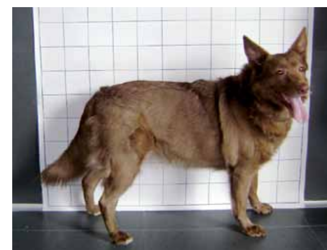
Before: 24 July 2009, Stella, 3.5 years old, weight kg 28.60. Above: seen laterally, below: seen from above.