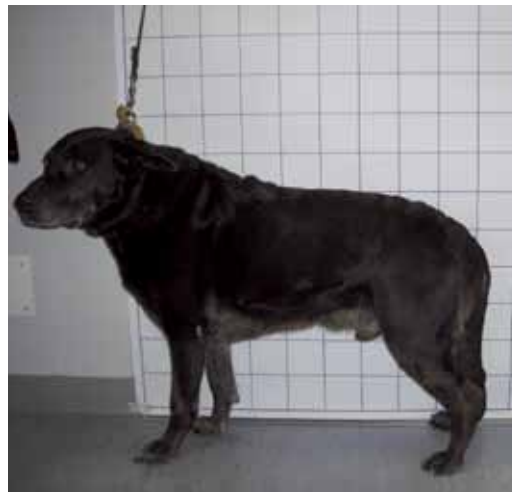
On the right: "after" - 5th November 2009, Balu', 8 years old, weight 40 kg, seen laterally.