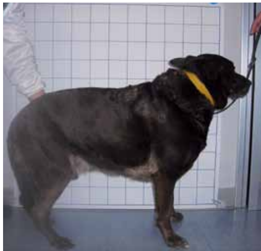
On the left: "before" - 15th July 2009, Balu', 8 years old, weight kg 49, seen laterally.

Range of reference for dogs: glycemia 50-100 mg/dl; total cholesterol 140-250mg/dl; triglycerides 50-150mg/dl