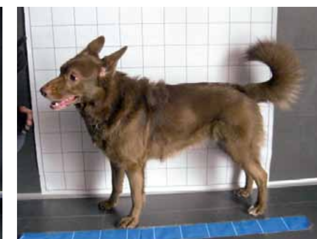
After: 5 November 2009, Stella, 3.5 years old, weight 22.60. Above: seen laterally, below: seen from above.