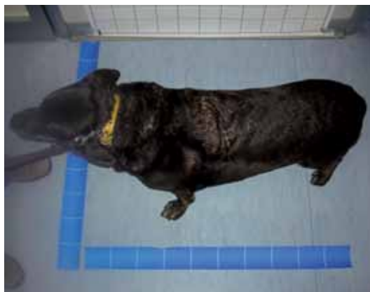
On the left: "before" - 15 November 2009, Balu', 8 years old, seen from above.